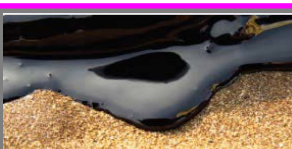
We Are the World