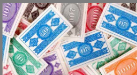
Game of Life™