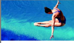
Lifestyles of the Fit and Famous