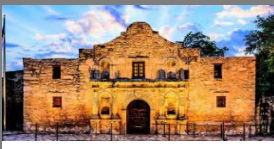
Looking at the Past with Eyes on the Future