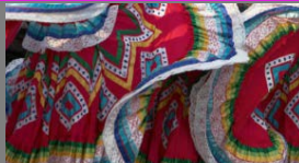
Rites of Passage